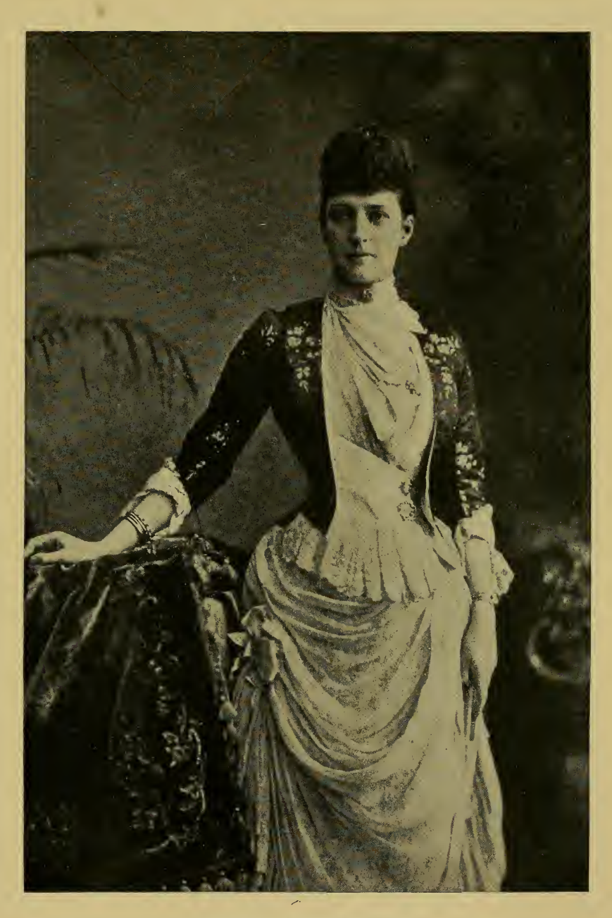
QUEEN ALEXANDRA. From a photograph taken when she was Princess of Wales.